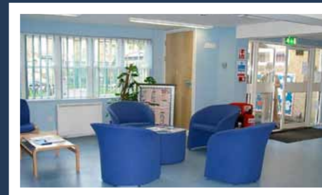
Main Entrance/Reception Area