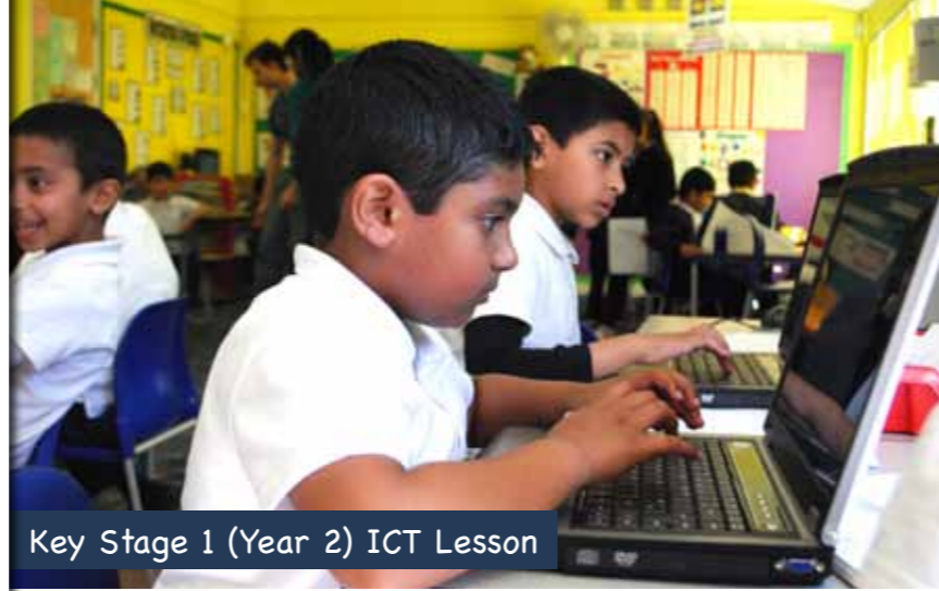
Key Stage 1 (Year 2) ICT Lesson

Our Equal Opportunity Policy is based on justice and the legal duty placed on schools and individuals.