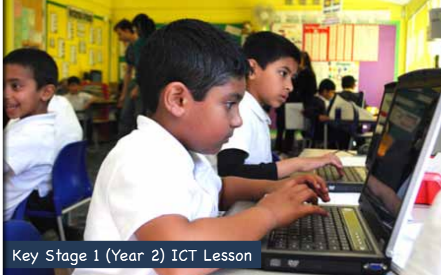
Key Stage 1 (Year 2) ICT Lesson

Our Equal Opportunity Policy is based on justice and the legal duty placed on schools and individuals.