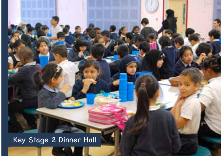
Key Stage 2 Dinner Hall