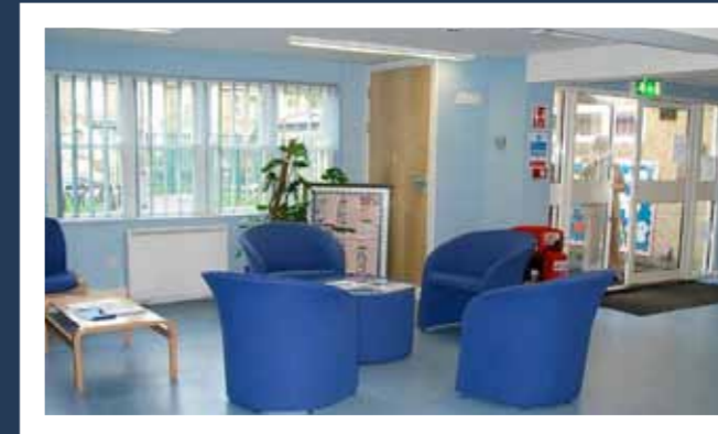
Main Entrance/Reception Area