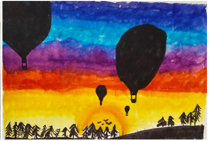
Ibrahim in 4P painted this beautiful sunset