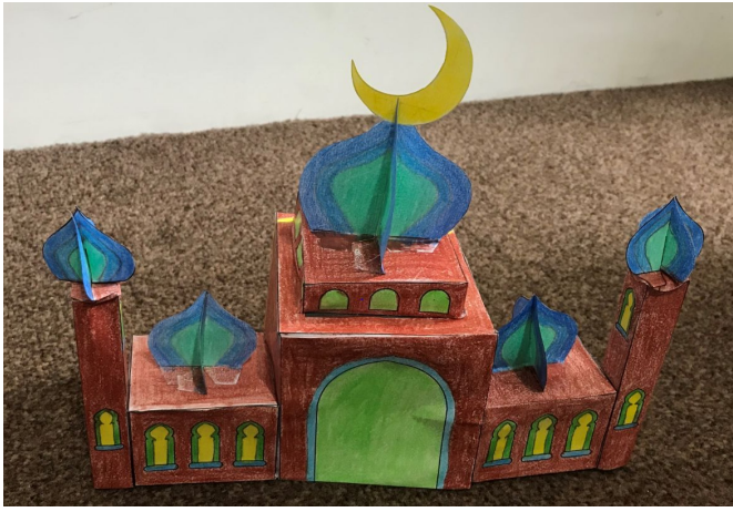
Haniya in 4M created this mosque