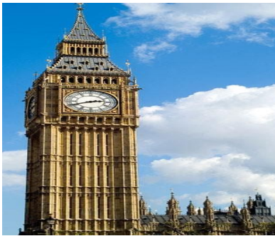
1. Big Ben/Houses of Parliament, London

Activity 1: C1/C2/C3 Look at the various images, label whether they are a physical or human feature.