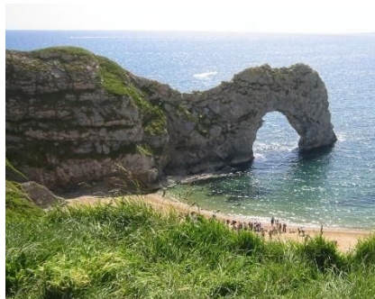
2. Durdle Door on Jurassic Coast, Dorset