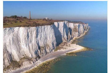
White cliffs of Dover