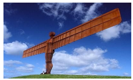
6. Angel of North, Gateshead

7. Explain in your own words what a physical and human feature is. You must provide two examples for each definition. Use your research skills to help you with this activity.