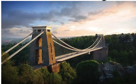
Clifton Suspension Bridge, Bristol