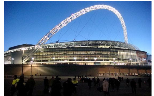
3. Wembley stadium, London