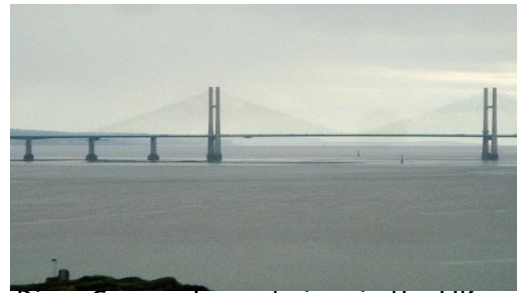
River Severn, longest river in the UK