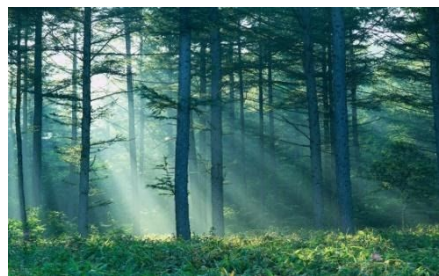
5. Forest of Dean, Gloucestershire