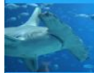
School of Hammerhead Sharks