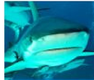
Grey Reef Shark

Sharks can be found in every ocean in the world. Most sharks don't live in freshwater but some, like the river shark and the bull shark, can live in both freshwater and seawater. Most shark attacks happen in Australia, South Africa, America and Brazil.