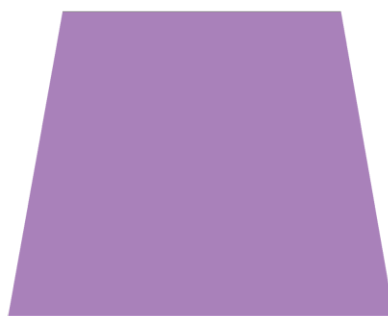
Trapezium (UK) Trapezoid (US)