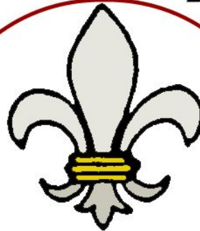
The Fleur de Lis

Christian's view the dove as the symbol of the Holy Spirit. In the Bible, a dove returned to Noah on the ark with an olive leaf in its beak, which was seen to be a sign from God that there was hope in the midst of the flood.