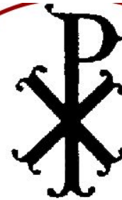
The Chi Rho

Another symbol of the Trinity, It is also symbolic of Mary the mother of Jesus.