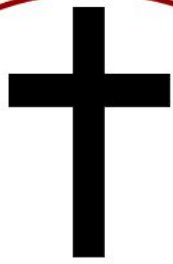
The Latin Cross

The most commonly used form of cross. It stands for Jesus' death and suffering. It symbolises the Resurrection., it is a symbol of faith to Christians everywhere.